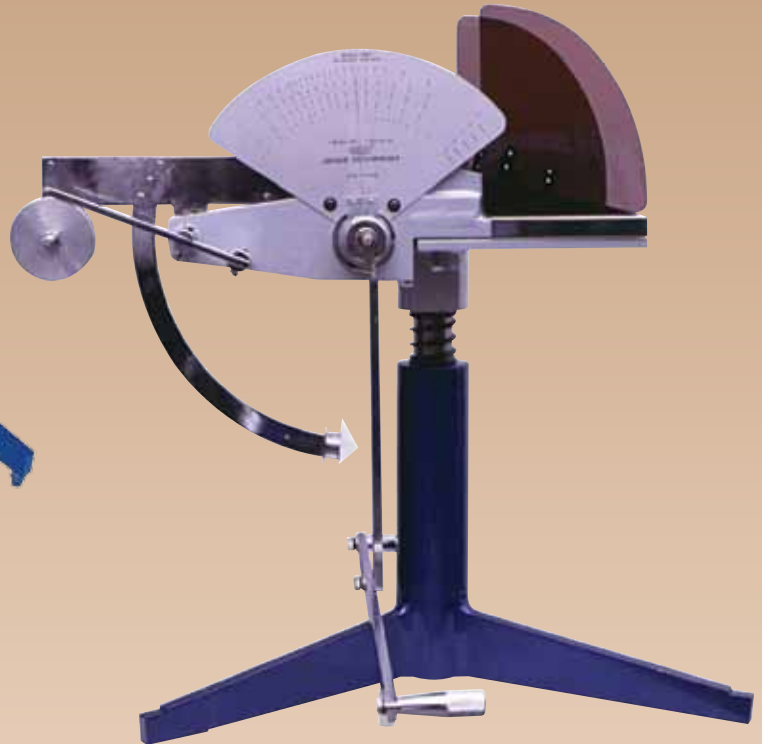
Product Code: UPR Mechanical Model