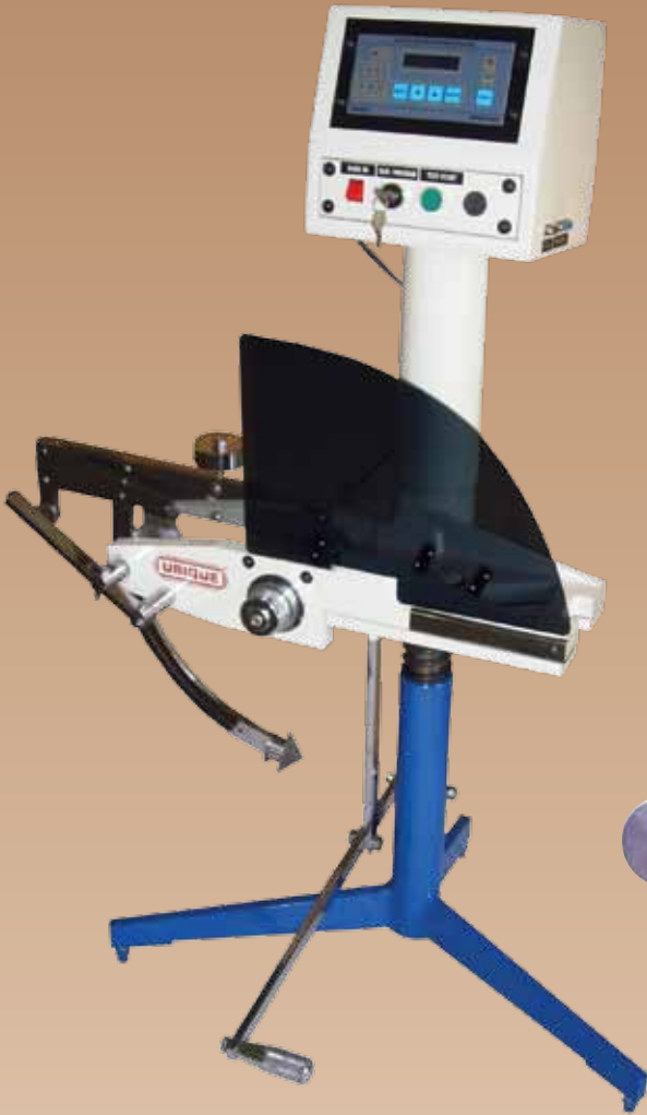
Product Code: UPR - Digital Microprocessor Based Model